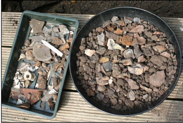
Fig 5: Unsorted finds from S1

Finds were those of a late 19 th / early 20 th century occupational dump – late 19 th century pottery (including some bone china), vessel glass, clay pipe fragments. The animal bone showed clear butchery marks and was seen as evidence for recent domestic dumping.