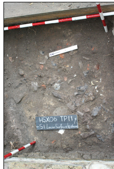
Fig 4: Lower surface of S1

The ash layer contained much rubble, including 4 pieces of a kitchen sink and much burnt animal bone. At 20cm down, large flints began to emerge, mixed with brick at first (see fig 4, right) but quickly becoming flint only and what seemed to be natural clay.