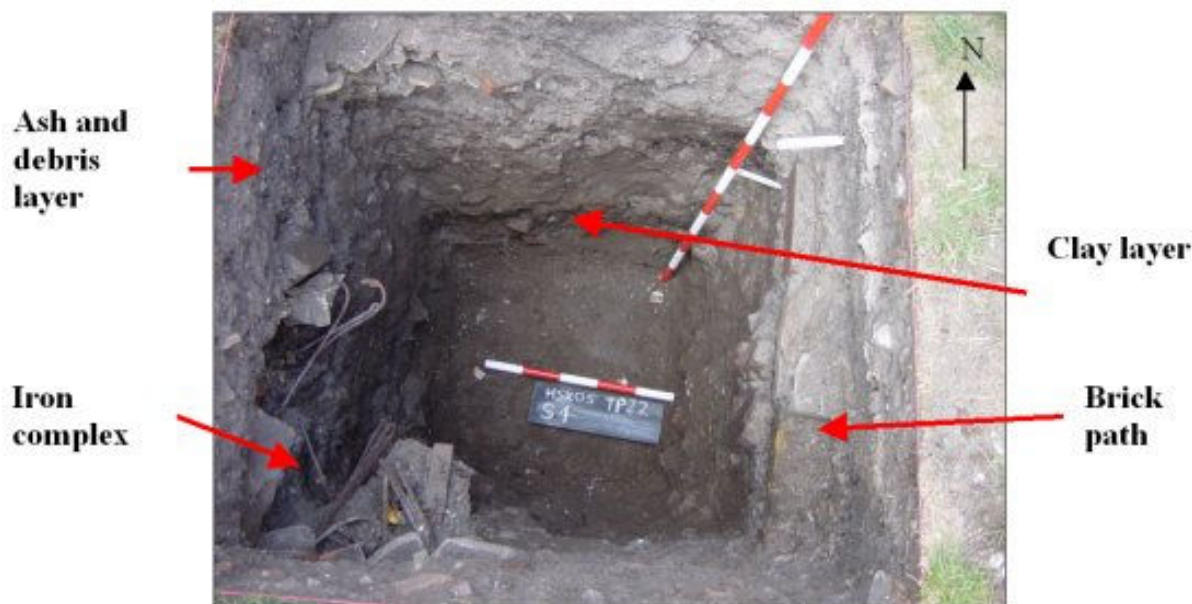
Fig 2: TP22 to the maximum depth, photo taken with back to the house.

three horseshoe fragments were found. This material continued down into Spit 3 in the SW corner and by this stage included iron sheets, strips, wire and rods. Some of these were embedded in the baulk, meaning that great care had to be taken in excavation for safety reasons.